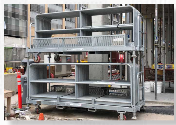
Our guardrail system "kits" simplify logistics & maximize efficiency & space.

The Hilmerson Safety Rail System™ eliminates many recurring project-based costs and allows for quick recovery of acquisition cost and provides a significant return on investment. By purchasing and deploying our safety rail system and eliminating wooden 2×4 guardrails, initial cost can be recovered in as quickly as two project deployments.